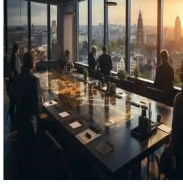
أمستردام - هولندا