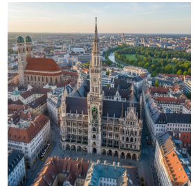
ميونخ - ألمانيا