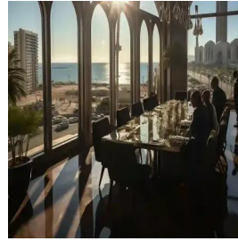
الدار البيضاء - المغرب