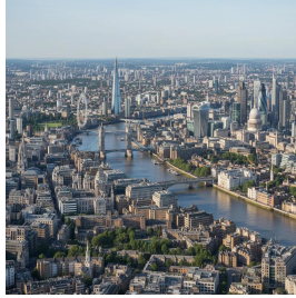
لندن - المملكة المتحدة