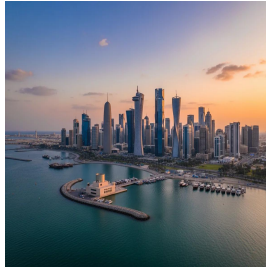
الدوحة - قطر