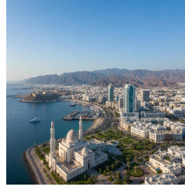
مسقط - سلطنة عمان