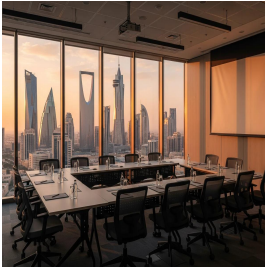
الرياض - المملكة العربية السعودية