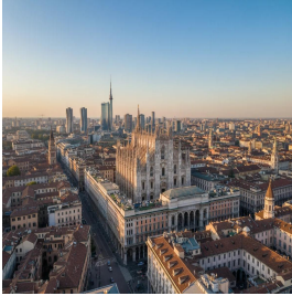
ميلان - إيطاليا