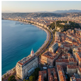
نيس - فرنسا