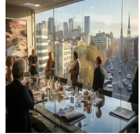
مدريد - إسبانيا