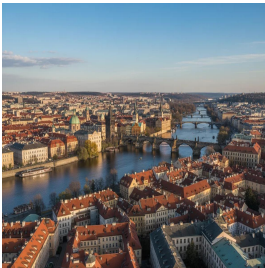
براغ - جمهورية التشيك