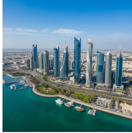
المنامة - مملكة البحرين