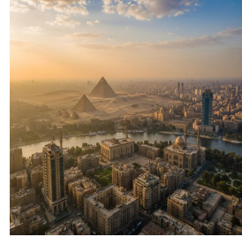
القاهرة - مصر