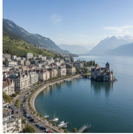
مونترال - سويسرا