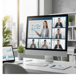
عن بعد - منصة زووم