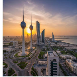
الكويت - الكويت