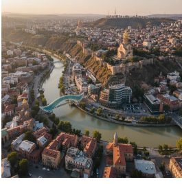
تبليسي - جورجيا