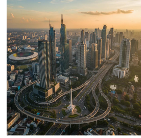
جاكرتا - جمهورية إندونيسيا