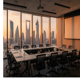
الرياض - المملكة العربية السعودية