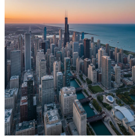
شيكاغو - الولايات المتحدة الأمريكية