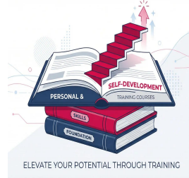
دورات المهارات الشخصية وتطوير الذات