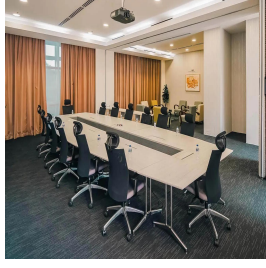
بوكيت - تايلاند