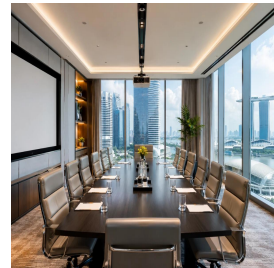
سنغافورة - سنغافورة